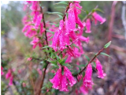
Epacris impressa Common Heath

As we head into late winter and spring, more of our native species are flowering. Here are some of those flowering at the moment. Please note that some of these images are motherstock plants, and may not be currently available for retail.