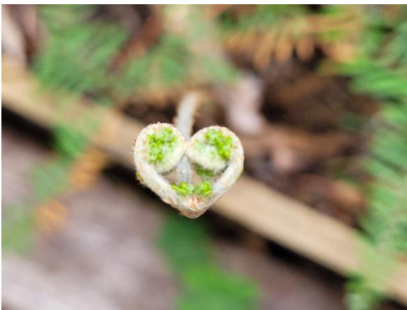
Spotted in the fern garden at Candlebark, even this fern says thanks!