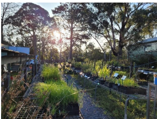
Look for available stock on our monthly stock list.

Once a month we publish a stock list of plants currently for sale in the retail area. The latest list is here , and is correct as at 22 July 2022. Please note that things do change, and if you want a specific plant, it's best to call or email to make sure we have it in stock.