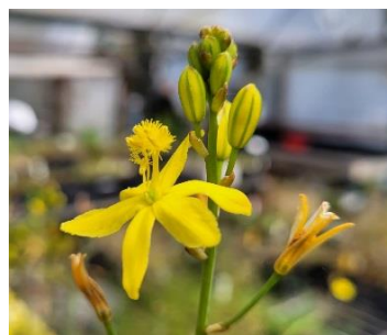
Bulbine bulbosa Bulbine Lily