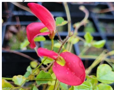
Kennedia prostrata Running Postman