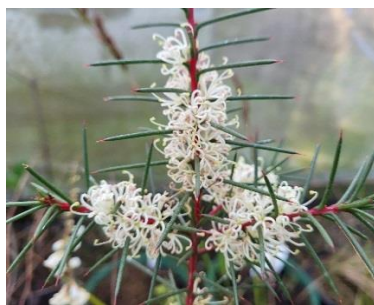
Hakea decurrens Bushy Needlewood