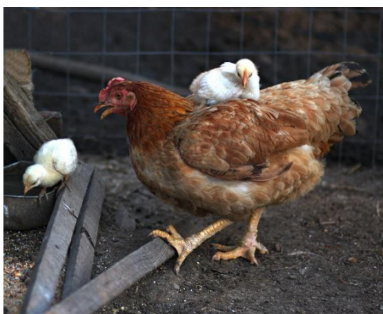
Learn about backyard chooks at a local event.

There are many events in the region that may be of interest. Please contact the organisers directly for information and booking.