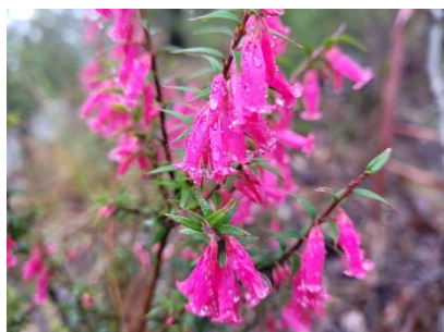
Epacris impressa Common Heath

As we head into late winter and spring, more of our native species are flowering. Here are some of those flowering at the moment. Please note that some of these images are motherstock plants, and may not be currently available for retail.