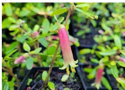
Correa reflexa Native Fuchsia