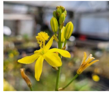
Bulbine bulbosa Bulbine Lily