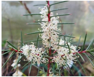
Hakea decurrens Bushy Needlewood