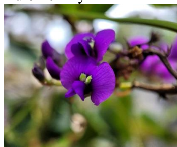
Hardebergia violacea Happy Wanderer