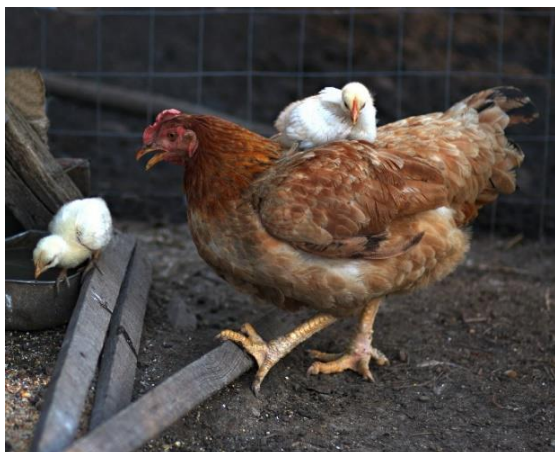
Learn about backyard chooks at a local event.

There are many events in the region that may be of interest. Please contact the organisers directly for information and booking.