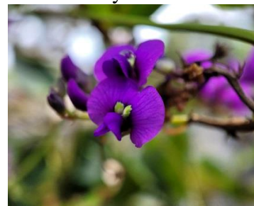
Hardebergia violacea Happy Wanderer