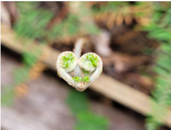
Spotted in the fern garden at Candlebark, even this fern says thanks!