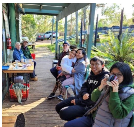
Sunday volunteers enjoying tea break.

Joining Candlebark could be for you – become a volunteer!