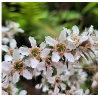
Leptospermum continentale Prickly Teatree

After a magnificent spring in Melbourne with lots of rain and sunshine – albeit with too much wind! – our flowering plants were looking amazing. Here is a sample from around the nursery: