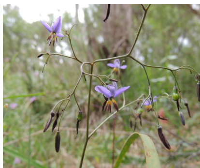
Dianella revoluta Black anther Flax Lily