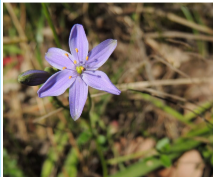
Chamaescilla corymbosa Blue Stars