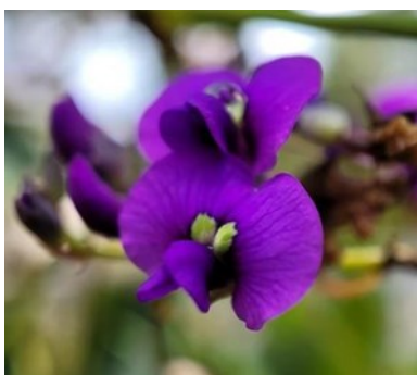
Hardenbergia violacea Purple Coral-pea