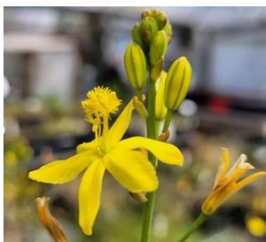
Bulbine bulbosa Bulbine Lily