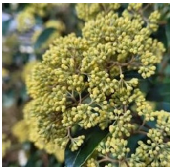
Pomaderris elliptica Smooth Pomaderris