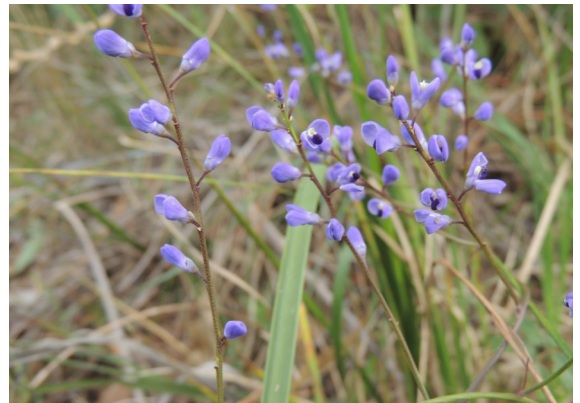
Comesperma volubile Love creeper

During this period the reserve tree canopy which was suffering from the loss of many Eucalypts suffered again in the storm that swept through the area. It was sad to see the many fallen trees and total loss of tree canopy in some areas of the reserve. However, this may have been a blessing for the resurgence of many ground covers and small shrubs that had been in danger of extinction over the past few years.