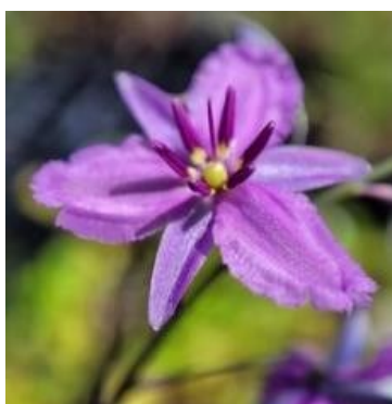
Arthropodium strictum Chocolate Lily