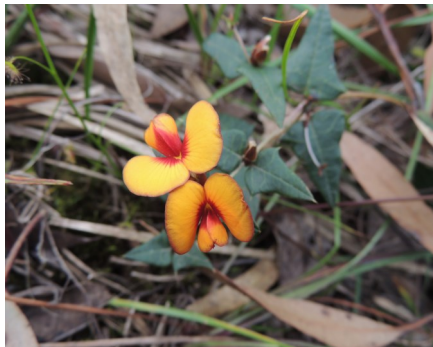
Platylodium obtusangulum Angled Flat Pea