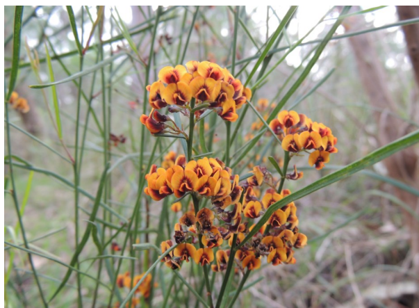
Daviesia leptophylla Narrow leaf Bitter pea