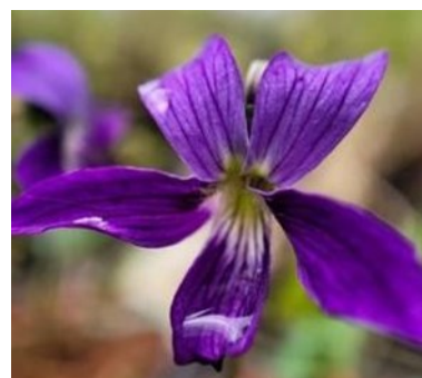
Viola betonicifolia Showy Violet