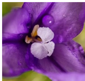
Patersonia occidentalis Long Purple-flag