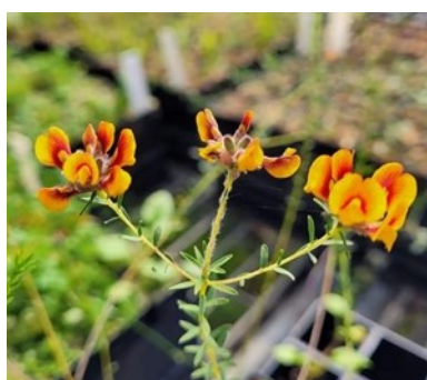
Almaleea subumbellata Wiry Bush-pea