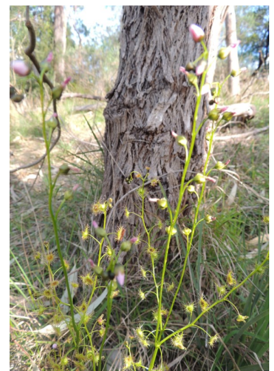
Drosea peltaat Tall Sundew